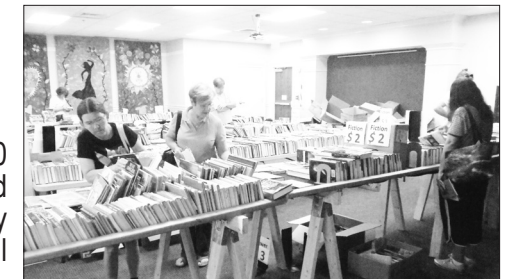
Shoppers browse at August book sale