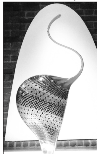
Flaming Curious Flamingo