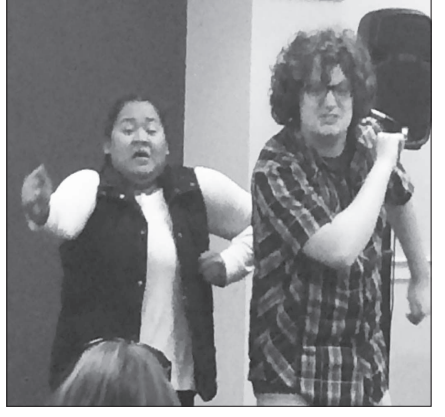
Forensic students perform dramatic storvtelling