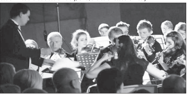
The Piccadilly Symphony Orchestra of Manchester, England.

Friends of the Library is a volunteer auxiliary support group for the Boyle County Public Library. Funds generated by Friends are used exclusively for the library, for such things as support for special programs, purchase of equipment and other items for use in the library. A major service of Friends is to provide volunteers for book sales.