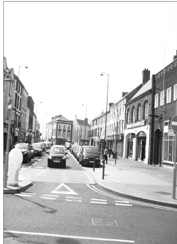
Above: Downtown street in Carrickfergus