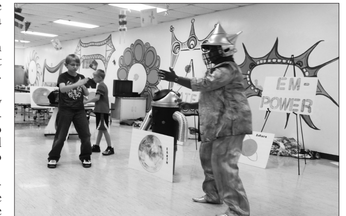
Children enjoyed learning with fun activities this summer.

BCPL card. Funding for this summer community outreach program came from a DANA Foundation Education Grant of $2,000 and $2,000 from Friends of the Library.