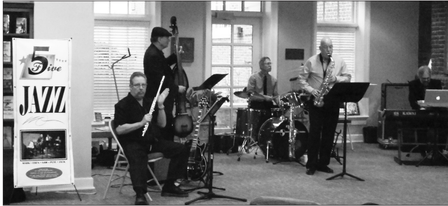
To celebrate the fifth anniversary of the new building and expanded Library, jazz group FIVE performed on January 11th.

When the First Baptist Church campus was offered For Sale, the planning committee gradually became convinced that whatever goals it had for an enlarged facility involved using that land. Nothing was easy, however, and we did not buy the property for nearly two more years. In 2005, the architectural firm of Pearson & Peters presented drawing which were received enthusiastically. We evidently still did not