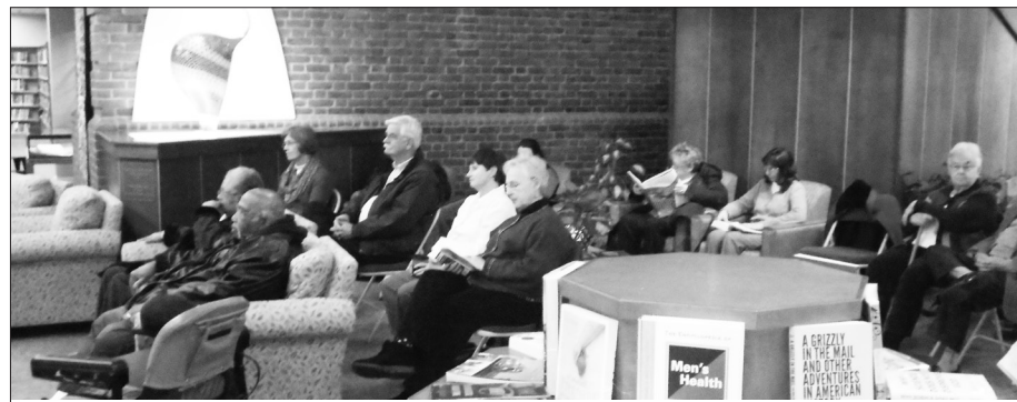
Audience enjoying concert by FIVE jazz band.

Yes, the reception and use of the library have been beyond the dreams of those who worked to plan it. Not only has the local Community admired and enthusiastically used the facility, numerous visitors from outside the area have reacted with amazement at such a stunning, vibrant library in a small Kentucky town. What a blessing that the building, the staff, and the patron usage have been so beyond our dreams.