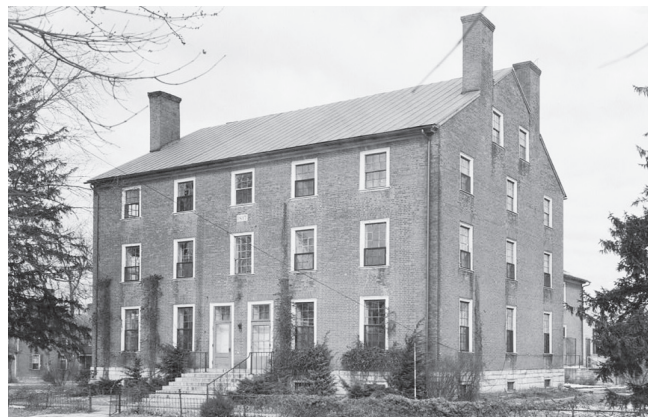
East Family Dwelling House circa 1940 as it appeared prior to extensive restoration of Pleasant Hill buildings that began in 1961.