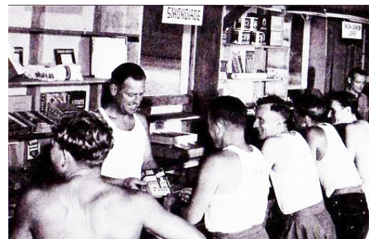
POW's at Ft. Knox POW Canteen