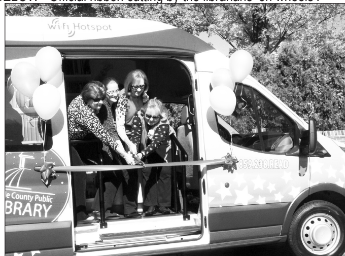
BELOW Official ribbon cutting by the librarians 'on wheels'.